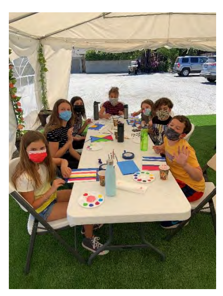
TASTY Bites 4<sup>th</sup>-5<sup>th</sup> grade

All Akiba Members in 4th - 12th grade are welcome and encouraged to participate in monthly events always focused on FUN ADVENTURES WITH AKIBA PEERS!