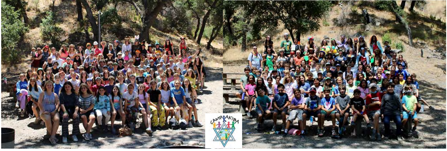
Two sessions but ONE BIG AKIBA HEART

Thank you to everyone for making this special summer program possible & so memorable!