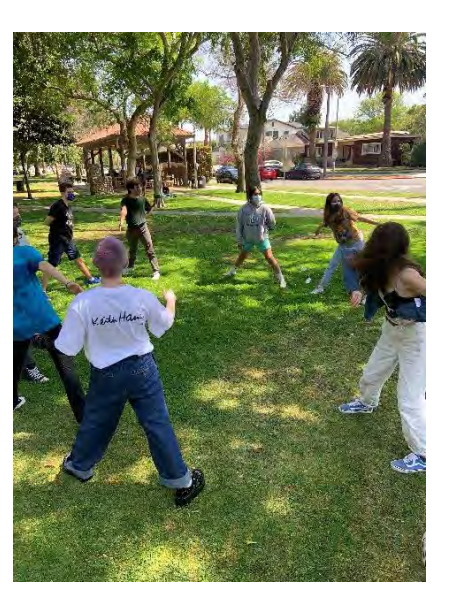
Senior TASTY 8<sup>th</sup>-12<sup>th</sup> grade

Fall 2021 Events will include movie nights under the stars, bonfires, hikes, outdoor Shabbat & Havdallah, beach/water sports, and more!